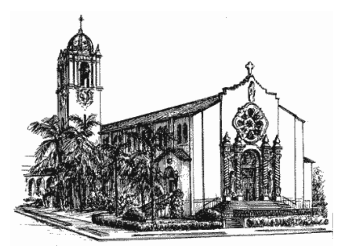
SAINT TIMOTHY'S CHURCH