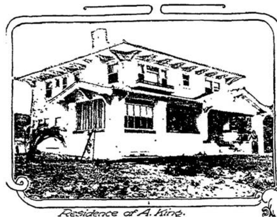
PICTURED IN 1914 L.A. TIMES ARTICLE “RENOVATION AT ‘THE PALMS’”