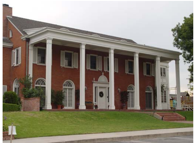
THE BAIN RANCH HOUSE IS A CENTERPIECE OF THE NOTRE DAME ACADEMY AT 2851 OVERLAND AVENUE