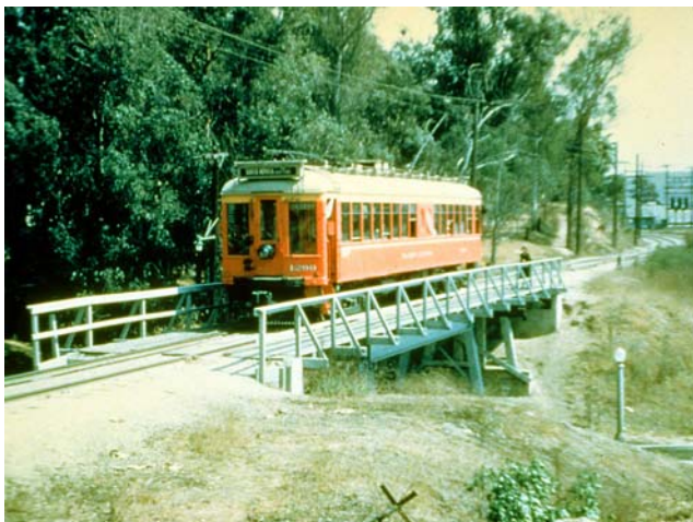
SANTA MONICA AIR LINE CROSSES OVER MOTOR AVENUE

Exposition Light Rail was planned for two phases for two reasons: “Lack of Funding for Project to Santa Monica” and “Lack of Consensus of a Route from Culver City to Santa Monica.” (Federal Transportation Agency (FTA) Record of Decision (Phase 1), pp. 6-7 see CheviotHills.org .) The FTA explained: “The Draft EIS/EIR considered an alignment for LRT that followed Venice Boulevard and Sepulveda Boulevard and did not use the MTA owned former railroad right of way in the areas adjacent to South Robertson, Castle Heights, Cheviot Hills, Westwood Gardens and the West of Westwood communities. Many comments were received that said that additional consideration should be given to an alignment that remained on the MTA owned right of way and did not divert around this segment. Due to a lack of consensus on this issue, no decision was made concerning the route of the future project from Culver City to Santa Monica and this question was deferred to a future study.” (Record of Decision (Phase 1), p. 7.)