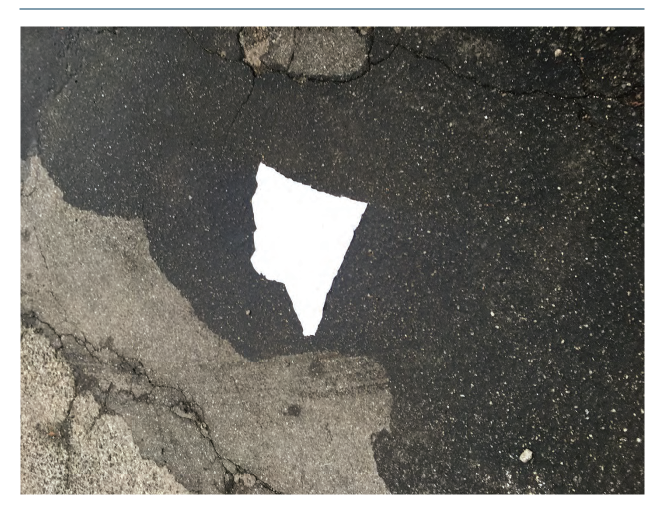
Figure 8 . This photo was taken before the rag was stepped on to show that there was no longer any leaked liquid present.