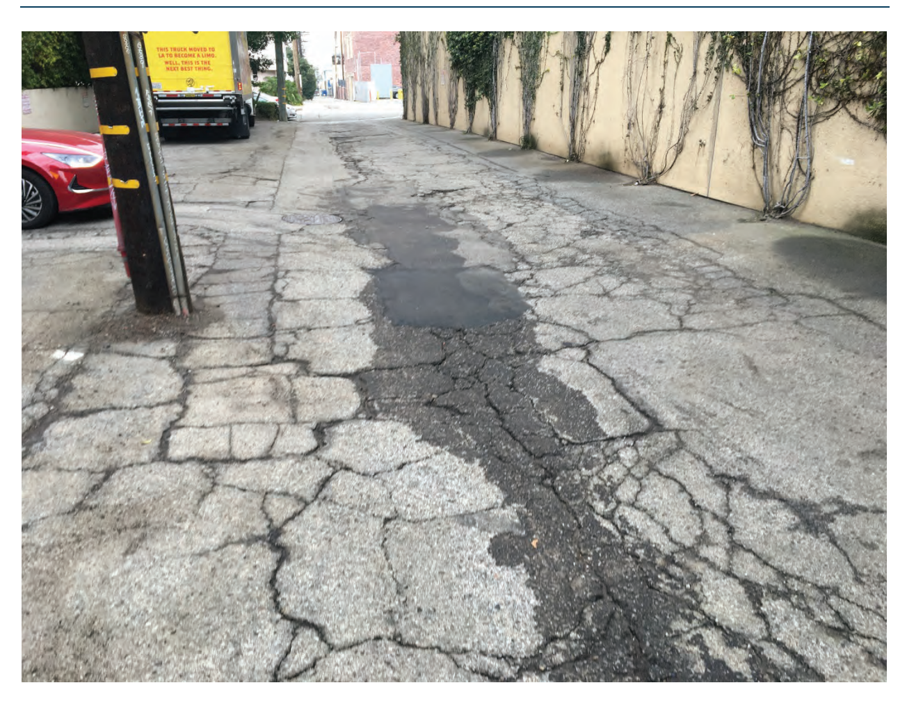
Figure 4. Shows areal extent of leaked fluid migration