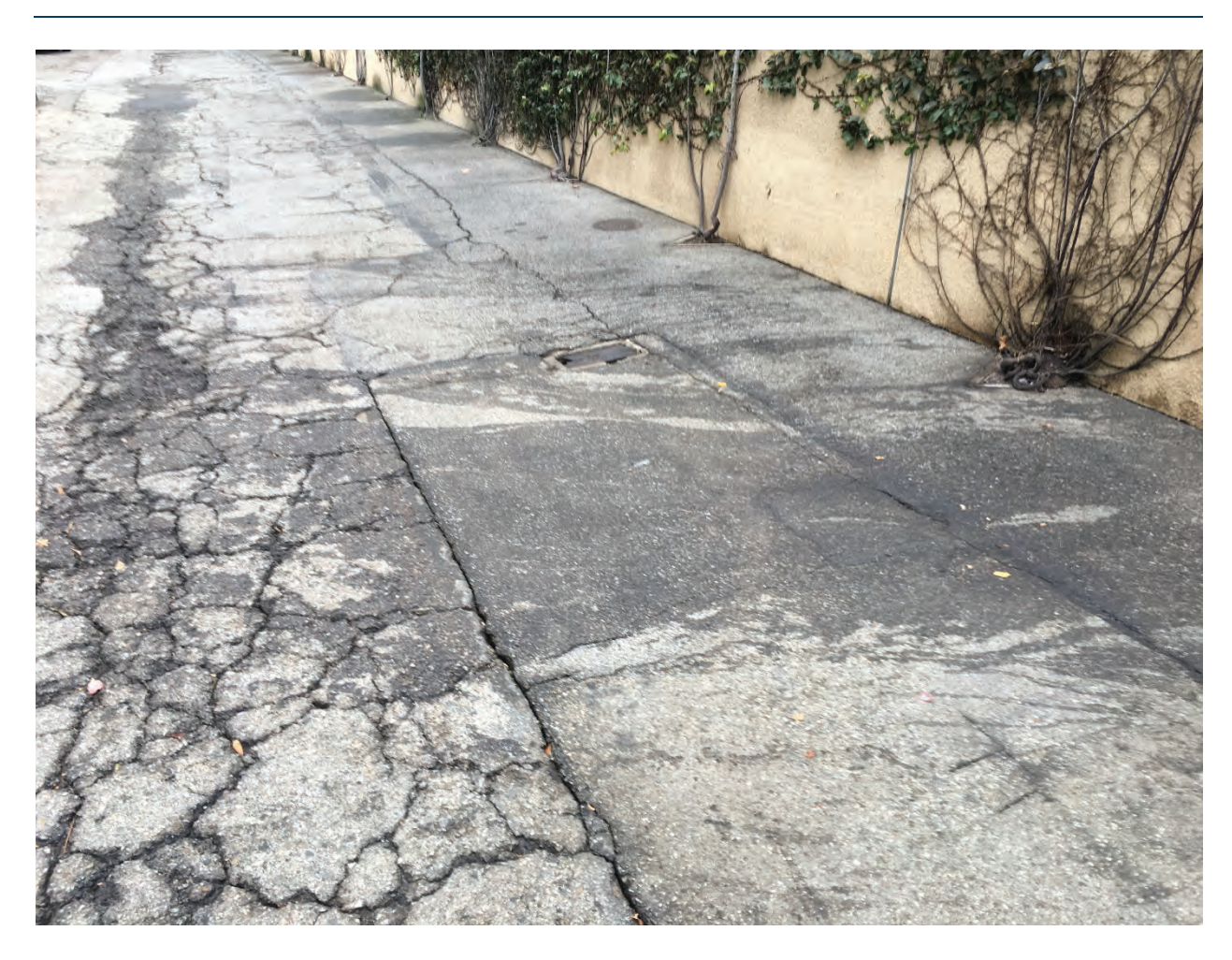
Figure 3. Staining shows point source with most discharge as well as lateral extent into the alley