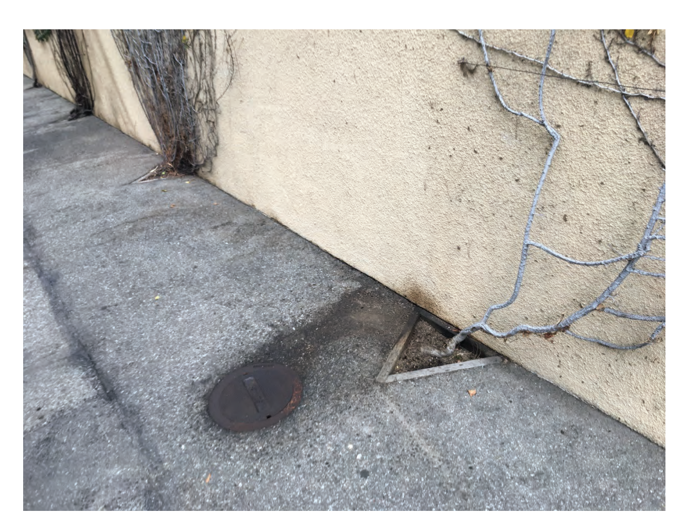
Figure 7. The leaks were in between these four vines pictured.