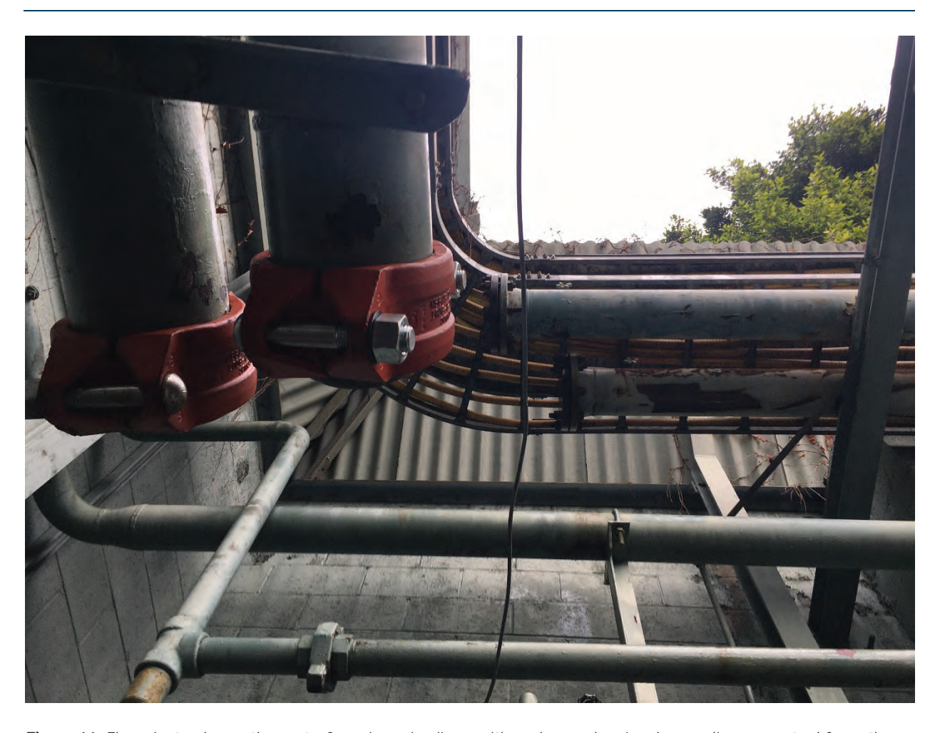
Figure 11 . The photo shows the out of service pipelines with red caps having been disconnected from the horizontal pipelines that are still under pressure. At the time of the leak, these two ends were connected and the out of service segment was isolated from pressure with the use of a "blind slip" that was found to be corroded to the point of leaking.