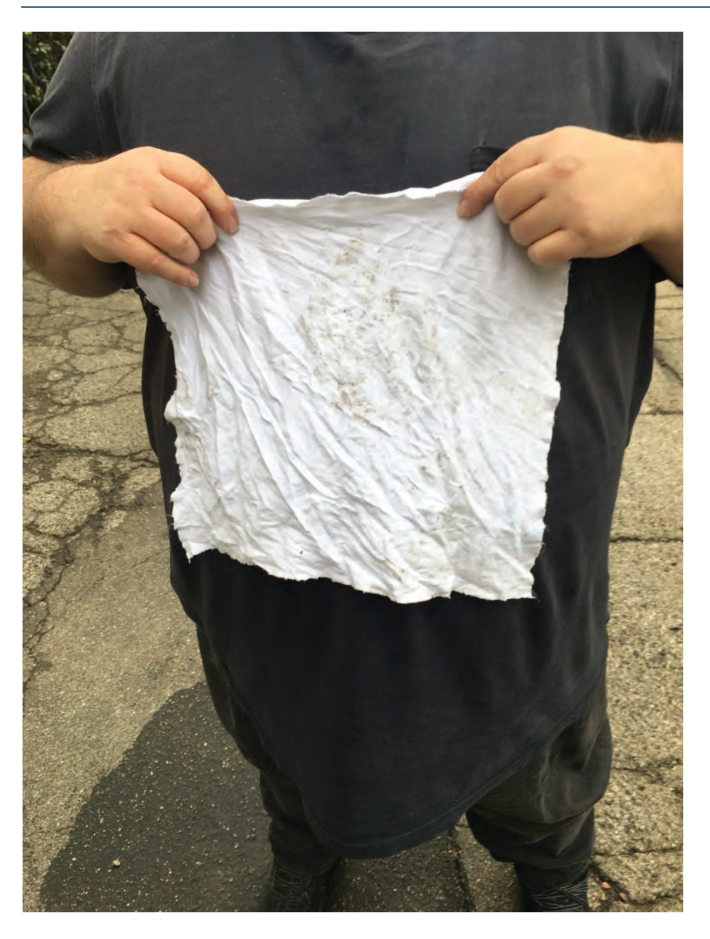
Figure 9. The rag was examined by J. Athanasious and did not show any evidence of liquid absorption.