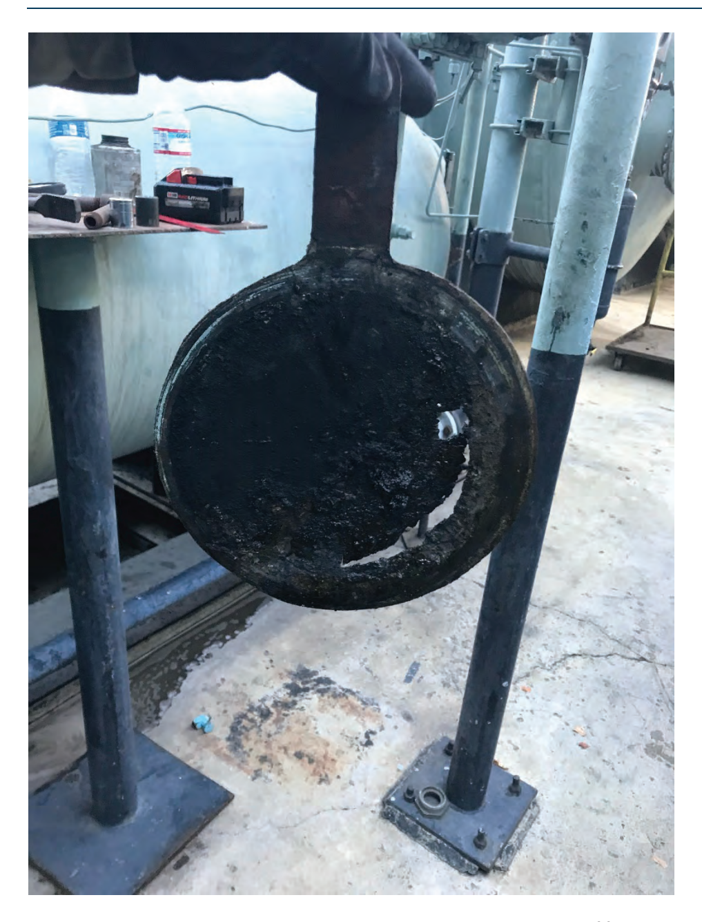
Figure 12 . This picture shows the corroded blind slip that was the root cause of fluid entering the out of service pipeline that is buried near surface expression of the leak in the alley.