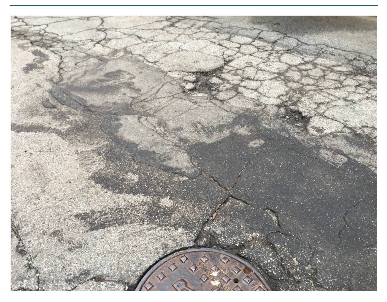
Figure 5. shows leaked fluid migration extent