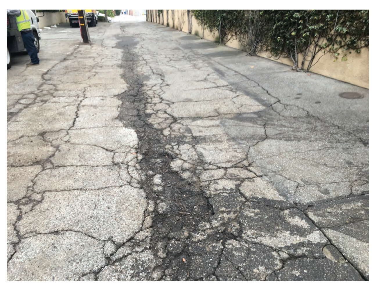
Figure 2 . This photo shows the area affected by the leaked fluid. The fluid pooled in the center of the alley and travelled west down the alley. It was reported that the fluid was removed with absorbent material and the ground was steam cleaned. At the time of the photo, there was no oil present. What is seen here is staining. There are no sewer or drainage systems affected. Visual staining was present on the alley surface.