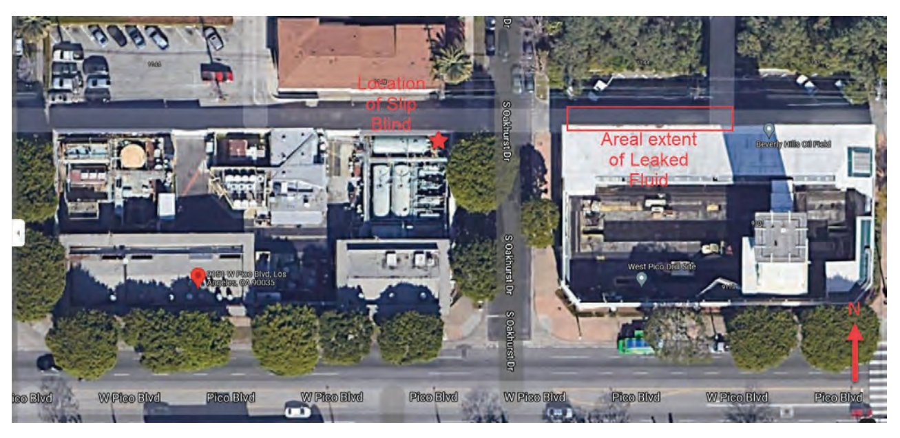
Figure 1 . Map of Drill site and facility compounds. Drill site is the right most building centered in map, facility compound is leftmost building centered in map.