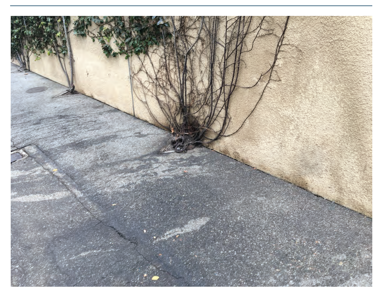
Figure 6 . The fluid was extruded through the joint where the building wall met with the asphalt alley. The area shown here was the main location of leaking with minor leaks further east and west in the photo. The area which had leaks was approximately 10 feet in length.